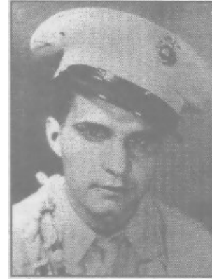
Guy Louis Gabaldon at 18.

and succeeded in not only obtaining vital military information but in capturing well over one thousand civilians and troops."