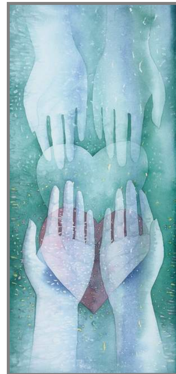
Reconciliation by Meganne Forbes

with equal force that steering one's conversations and one's life toward genuineness, creativity, compassion, etc., will probably never be easy. But this struggle is what will allow us to feel more fully alive and more deeply human. The good news is that we can approach all the virtues of full humanness one conversation at a time. Our lives are, among other things, a series of conversations, and therein lies one of the most significant doorways to personal development. We vote with each conversation, both for what kind of person we want to become, and (to borrow a phrase from Ram Dass) for what kind of world we ourselves want to live in.